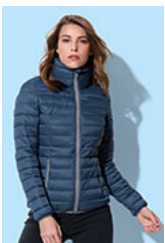
ST5300 Padded Jacket