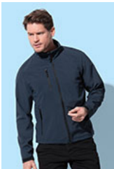
ST5230 Softest Shell Jacket